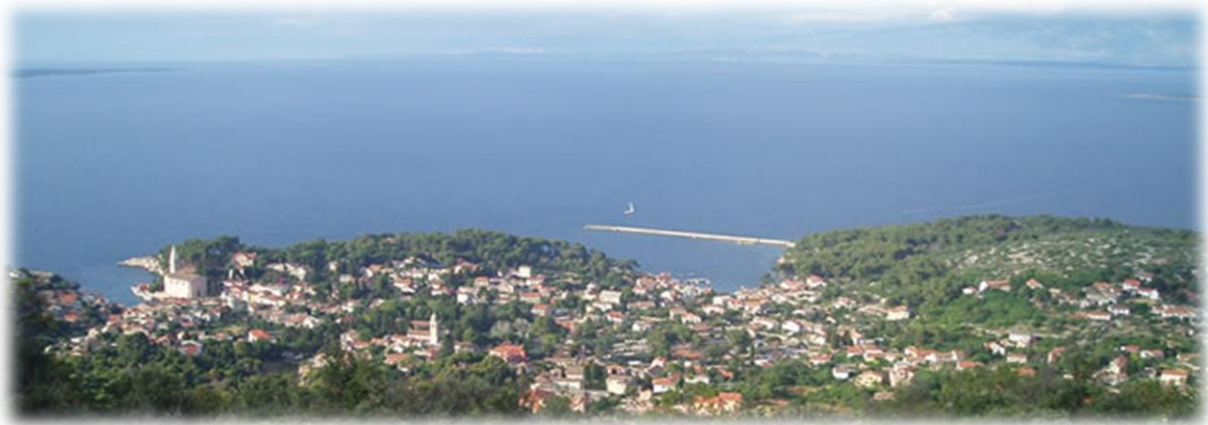
Town of Veli Lošinj - our location