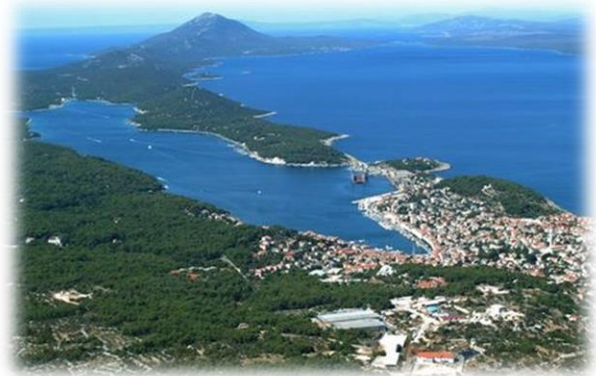
Town of Mali Lošinj

The coastline of Lošinj is extremely diverse; it consists of many large and small bays and underwater caves. The field-base is located in the old village of Veli Lošinj (3 km distant from Mali Lošinj – the biggest island town in Croatia) on the sheltered east coast of the island. The water falls to a depth of around seventy metres; the seafloor is mainly mud, with areas of sea-grass and limestone reefs. There are more than 95 species of fish found in these waters, and other top predators such as loggerhead turtles, tuna, sharks and swordfish regularly visit this area. The marine environment around Lošinj is the cleanest part of the Northern Adriatic Sea, with underwater visibility of consistently over twenty metres. We encourage you to explore the island and take advantage of the untouched natural environment that surrounds you.