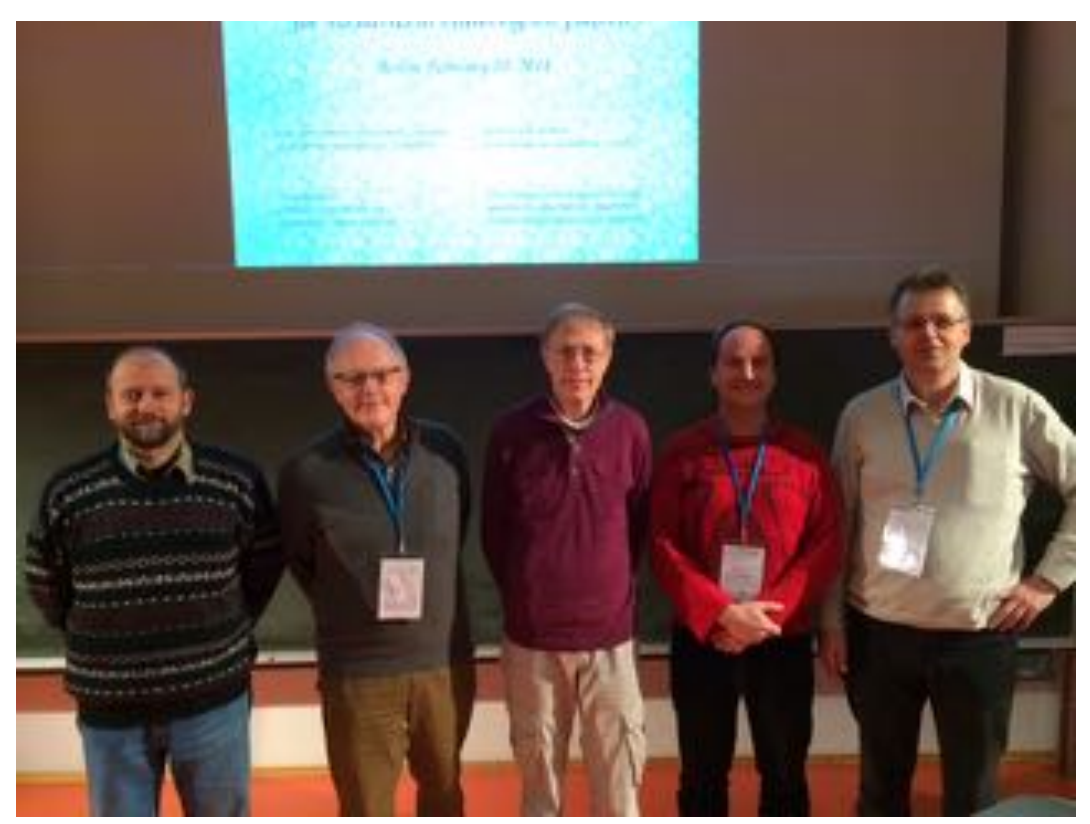
EuroGiga final conference, February 16 - 21, 2014, Berlin, Germany