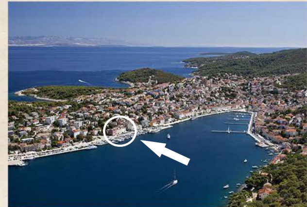
Location of the house in Mali Lošinj

The house has Wi-Fi and a computer is available in office in Veli Lošinj. You can use it any time during the opening hours. In addition, some bars and restaurants in Mali and Veli Lošinj offer Wi-Fi access for their guests.